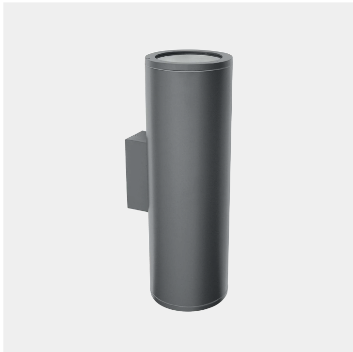
Tube Wall Up&