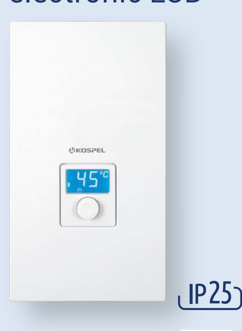
Electronically controlled heater with LCD display.