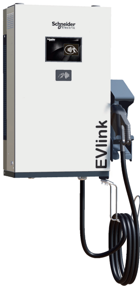
Monostandard Wall Mounted