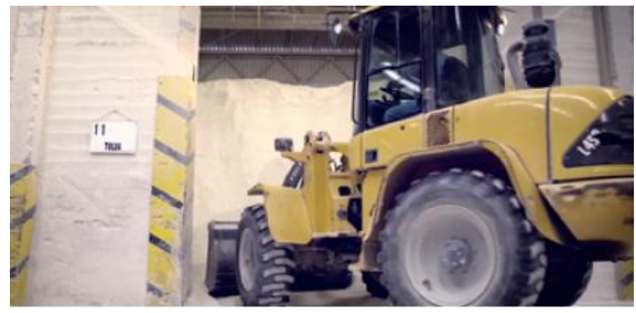
1. Unloading of raw materials

The stages of the production process are as follow: