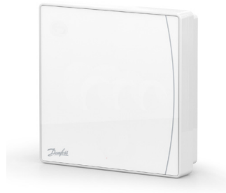
Danfoss Icon2™ Sensor 088U2120